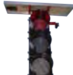
Optional Solar Charging / Outrigger Package