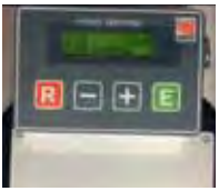
Full Matrix On-Board Traffic Controller