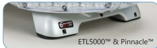
ETL5000™ & Pinnacle™