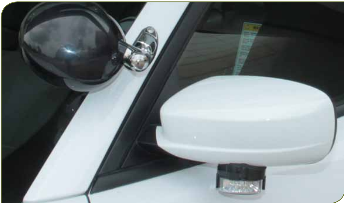
Intersector Under Mirror Light - Dodge Charger