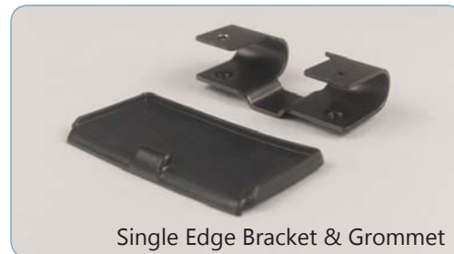
Single Edge Bracket & Grommet