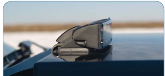
Single Light in Black Edge Mounted to the hood on a Ford Mustang police vehicle.