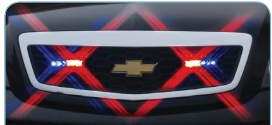
Two GHOST™ lights in Red/Blue (J) mounted inside the grille of an undercover Chevrolet Caprice.