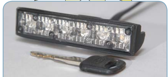
GHOST™ Mini Light is a very narrow, compact yet powerful light. Light head is adjustable up to 30 degrees.