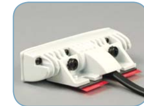
3M Super Duty Adhesive Mount