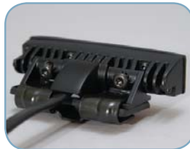
Single or Dual Edge Mount Brackets