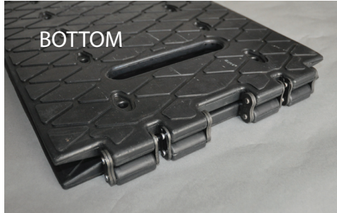
1. Fold RoadQuake 2F TPRS to expose bottom surface.

To add Safety Brackets, reuse existing parts, and brackets provided by PSS.