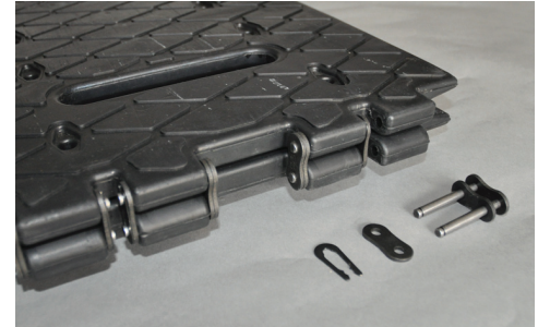
2. Remove existing chain link parts. Parts shown above.