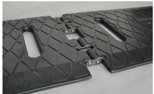
Top side should also look flat and smooth.