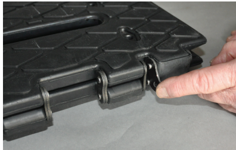
7. Install outer chain plate.