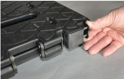
6. Install link. Lubricate link with soap and water for easier installation.