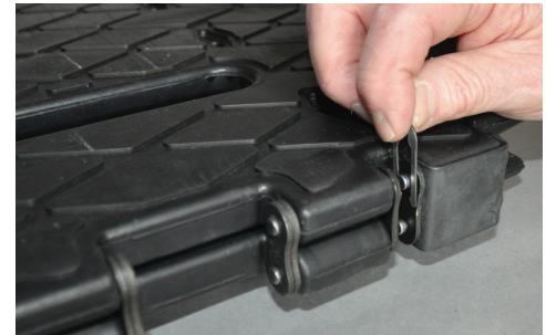
8. Install locking clip. Repeat all steps as necessary.