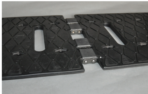
Bottom side should look like this, flat and smooth.