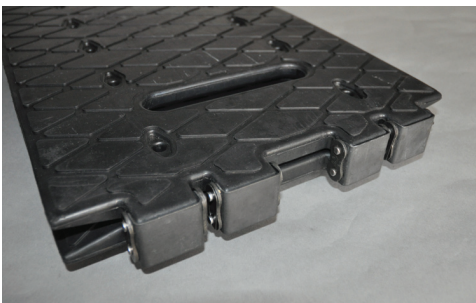
Final installation of all 4 Safety Brackets should look like this.