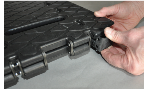
5. Center the bracket over the holes.