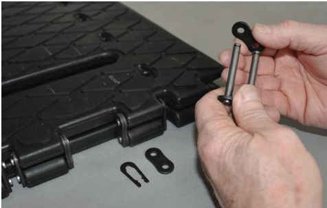
3. Discard 1 chain plate. Add Safety Bracket to remaining parts.