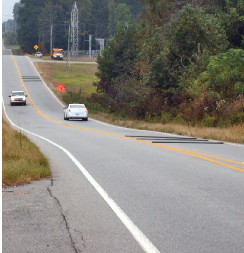
RoadQuake 2F TPRS alerts distracted drivers to changing road conditions, like work zones or check-points.