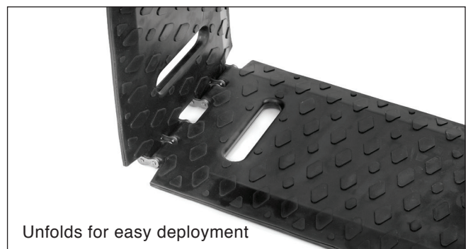
Unfolds for easy deployment

RQ TPRS meets Section 6F.87 of the MUTCD , 2009 Edition.