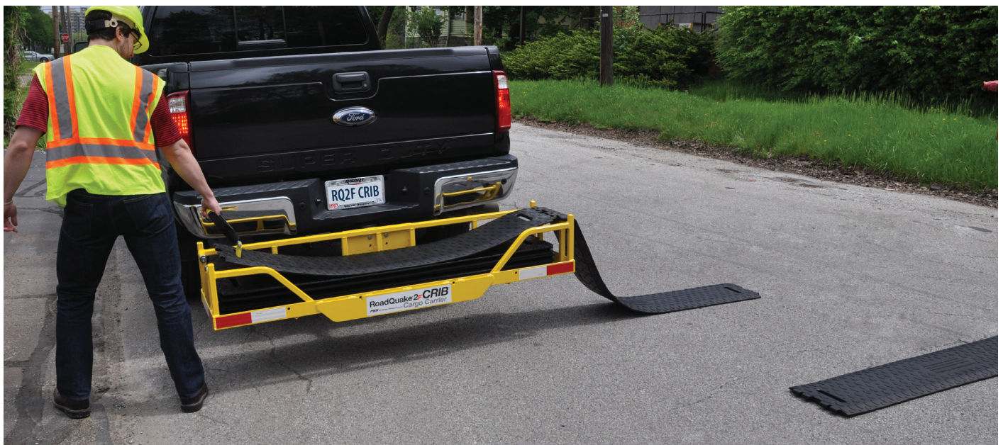
Deployment and removal of an array can be a one person job using the RoadQuake 2F CRIB® Cargo Carrier.