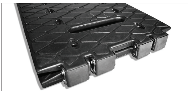
Folds for easy storage and transportation